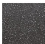
TS 80 anthracite