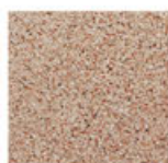
TS 20 rosé