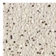
Granular surface (R 11/B)