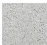
TS 60 grey