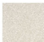
TS 10 white