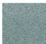
TS 50 mint